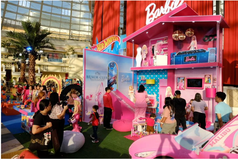
7. Barbie fans at the Barbie Dreamhouse