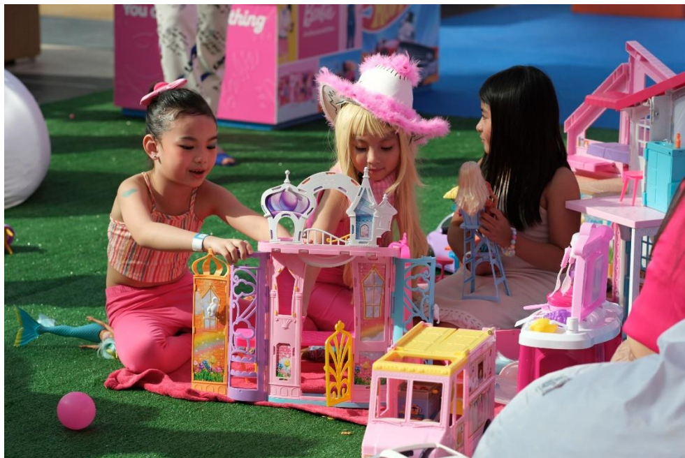
8. The Barbie immersive creative play spaces celebrate self-expression and imagination.